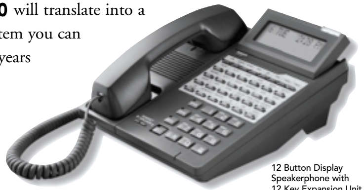
12 Button Display Speakerphone with 12 Key Expansion Unit

Packed with robust features typically found in high-end PBX systems, the X eo was designed for Abrivo by Iwatsu, a world-renowned Japanese telecommunications manufacturer. Iwatsu manufactures several products for major suppliers such as Panasonic and the Nippon Telegraph and Telephone Company (NTT) to name just a few. You can rest assured that the quality and engineering built into the X eo will translate into a telephone system you can count on for years to come!