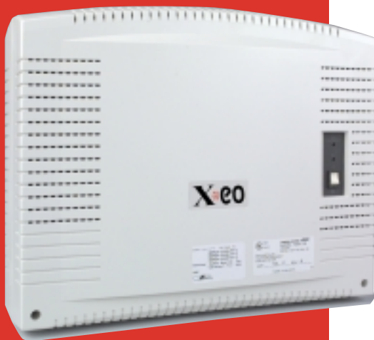
System Main Control Unit